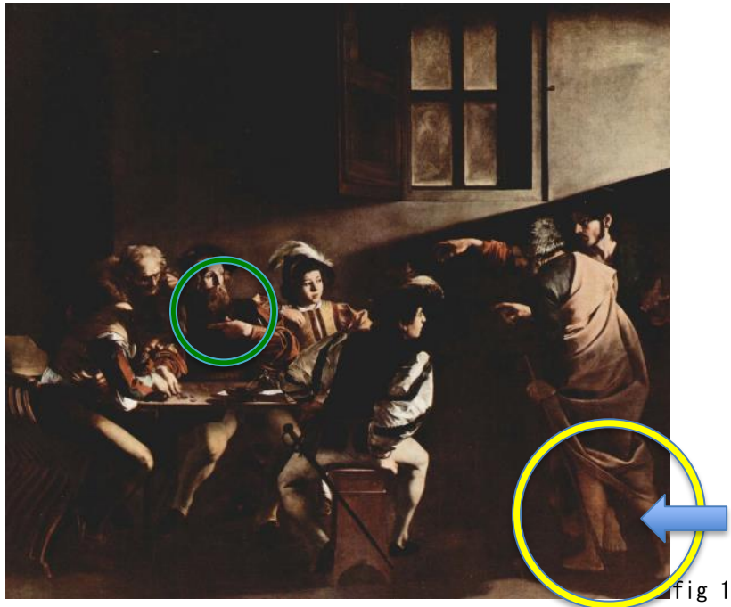
“ The Calling of Saint Matthew” oil on canvas 322x340

Church of San Luigi dei Francesi, Rome 1600